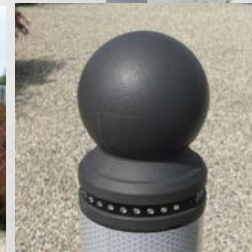
Diameter 80 with ball on top