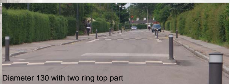
Diameter 130 with two ring top part