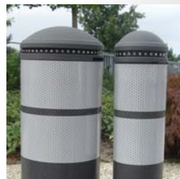
Diameter 80 and 130