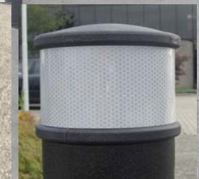
Diameter 130 with two ring top part